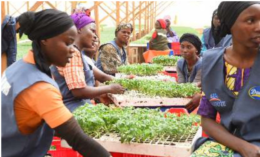
Preparation of Tomato Seedlings