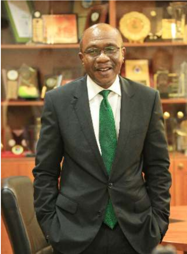
A smiling Governor Emeziele