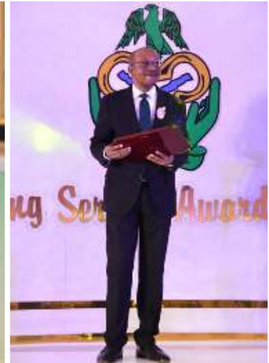
Presenting long service awards to deserving staff