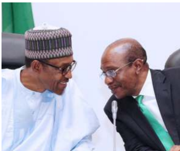
Conversation with the President

With the economic devastation caused by COVID-19, the Emefiele led-Central Bank of Nigeria rose to the occasion and injected N1trillion across all critical sectors of the economy. A further N100billion in loans were made available specifically to the health sector to assist in the war against the Coronavirus.