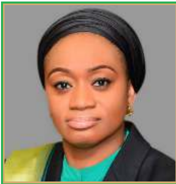
Aishah Ahmad Deputy Governor (Financial System Stability)