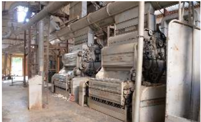
Cotton Ginny in Wawa, Niger State