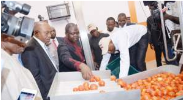
Inspecting a tomato processing plant

Revision of Guide to Bank Charges: The Central Bank of Nigeria (CBN) also released a revised guide to charges by banks, other financial and non-bank financial institutions to replace the one issued in May 2017. The revised guide to charges is one of the moves to foster and build an inclusive banking system that adequately caters for the needs of banking publics while preserving the financial sustainability of bank and other financial and non-bank financial institutions.