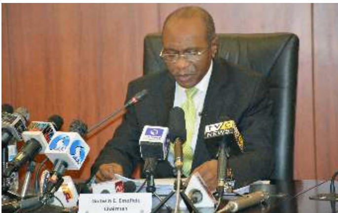
Reading out the MPC communique