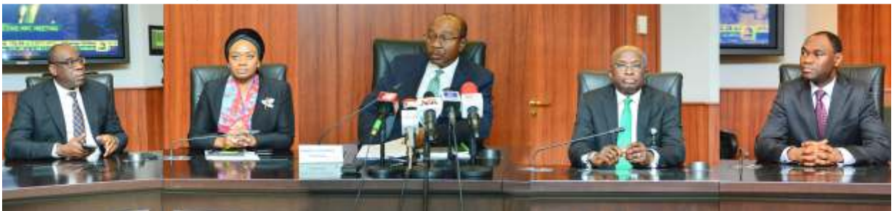
Committee of Governors