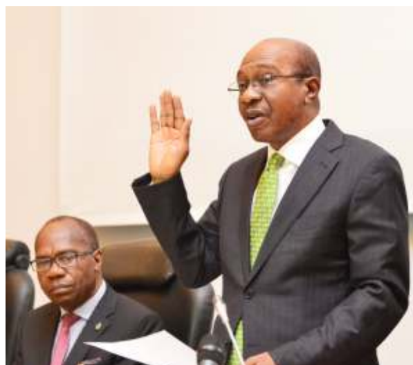
Affirming his oath of office

In Argentina, though the economy was in recession throughout 2016, moderate upticks which peaked at 1.9 percent quarter two of 2017 ended that recession. However, the Argentinian economy shrank by 4.0 per cent in quarter two of 2018, bringing the country to the brink of another recession. The Brazilian economy had been in recession since 2015 and only emerged from it in first quarter of 2017 with a growth rate of 1.0 percent. Since then the growth has slowed progressively until the last quarter of 2017 when