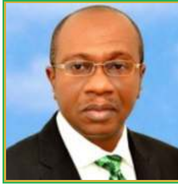
Godwin I. Emefiele CBN Governor (Chairman)