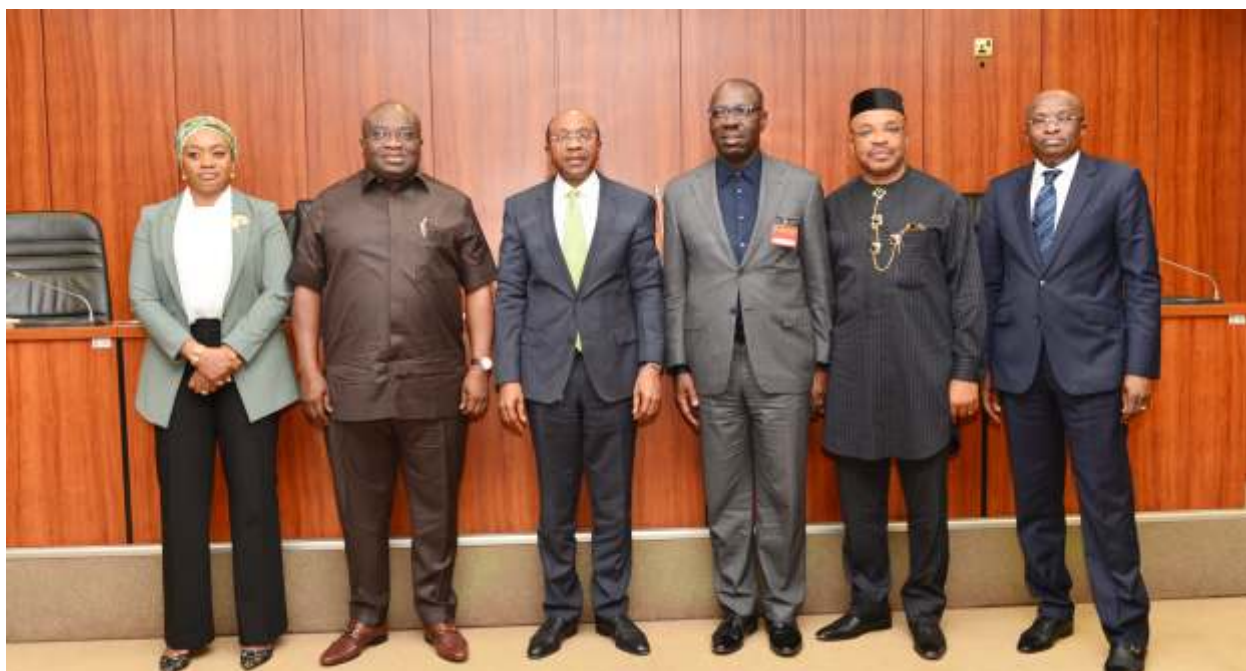
With Governors of oil producing states

can leverage encumber to obtain financing; and given the opportunities in agri-business among others. The Collateral Registry regime allows Nigerian farmers and entrepreneurs to unlock significant sources of capital with assets such as automobiles, phones, laptops, jewelry, selected household items, boats, title documents as well as farm produce and intellectual properties that would otherwise not be looked at by lenders as potential collateral. Global Standing Instruction (GSI): Fast forward to 2020 as part of the earlier