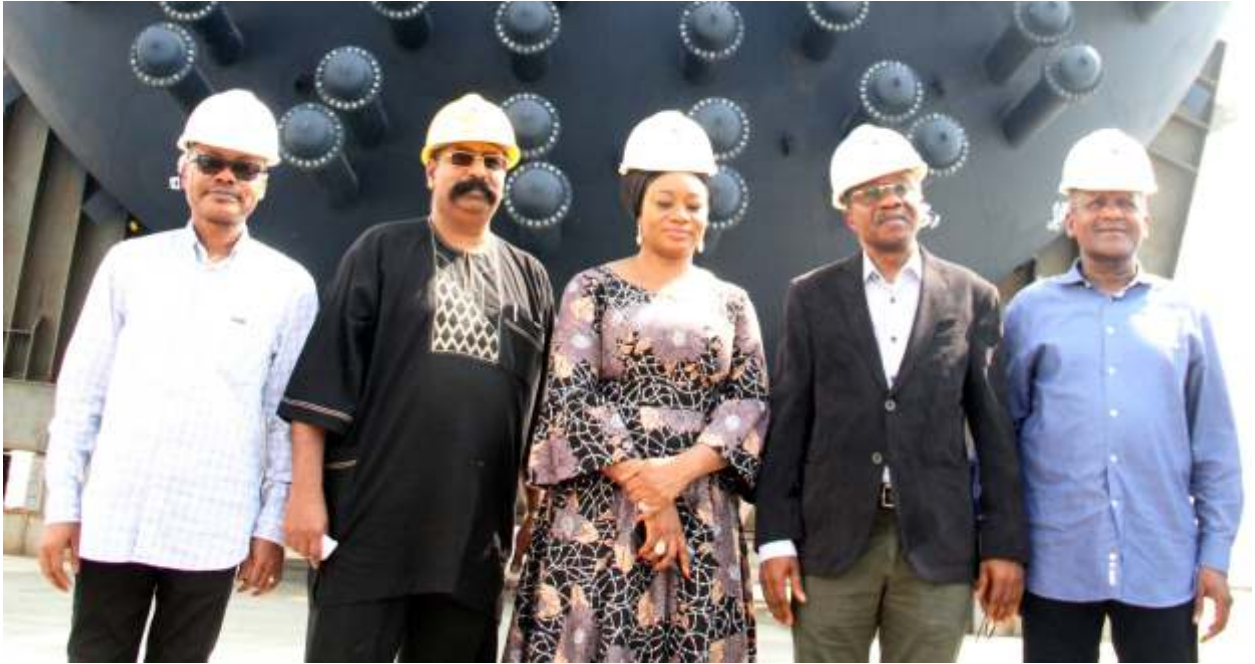
On a tour of Dangote Refinery