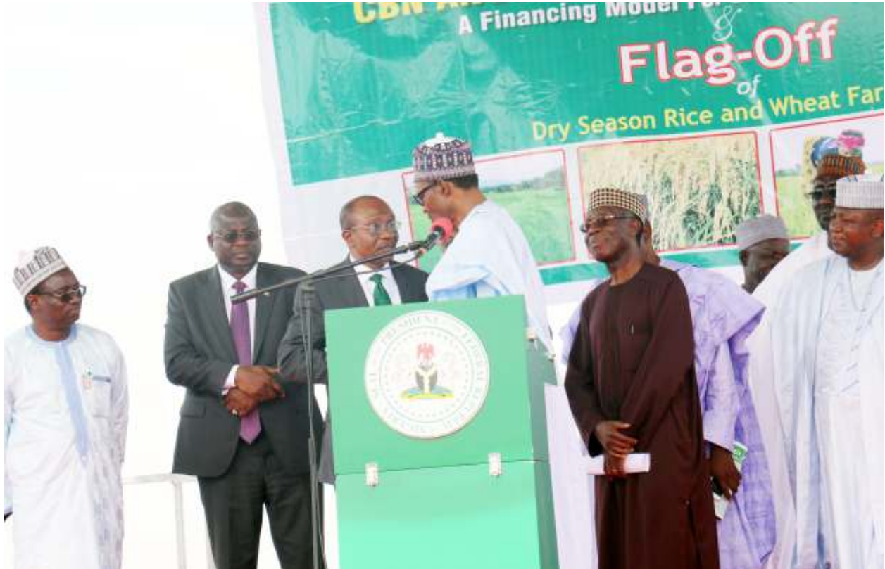
With President Muhammadu Buhari during the flag-off of dry season farming

On assumption of duty as the Governor of the Central Bank of Nigeria (CBN) in June 2014, Mr. Godwin Emefiele listed his strategic plan of work to ensure sustainable development and economic growth of the country. Particularly, he stated that the core of his vision is to effectively manage potential threats to financial stability, and to create a strong governance regime that is conducive for financial intermediation, innovative finance and financial inclusiveness.