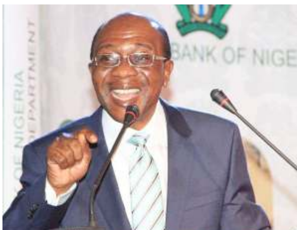
Gov. Emefiele during home coming lecture at University of Nigeria , Nsuka

improving FX supply and financial inclusion, as well as the health sector.