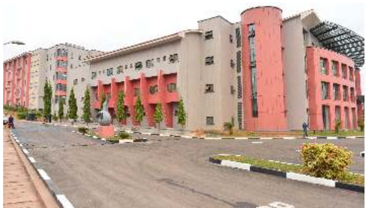
Centre of Excellence, University of Nigeria, Nsuka