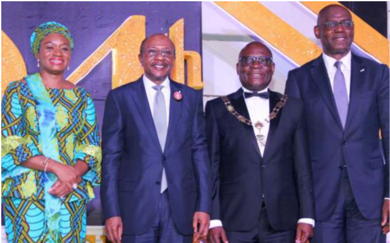
L-R, Aishah Ahmad (Deputy Governor, Financial System Stability), Godwin Emefiele (CBN Governor), Oluseye Awojebi (Registrar, CIBN) and Emeka Emuwa (CEO, Union Bank of Nigeria)

The Central Bank of Nigeria however lowered its policy rate from 13.0 to 11.0 per cent in November 2015 to stimulate lending to the real sector and spur growth and employment.