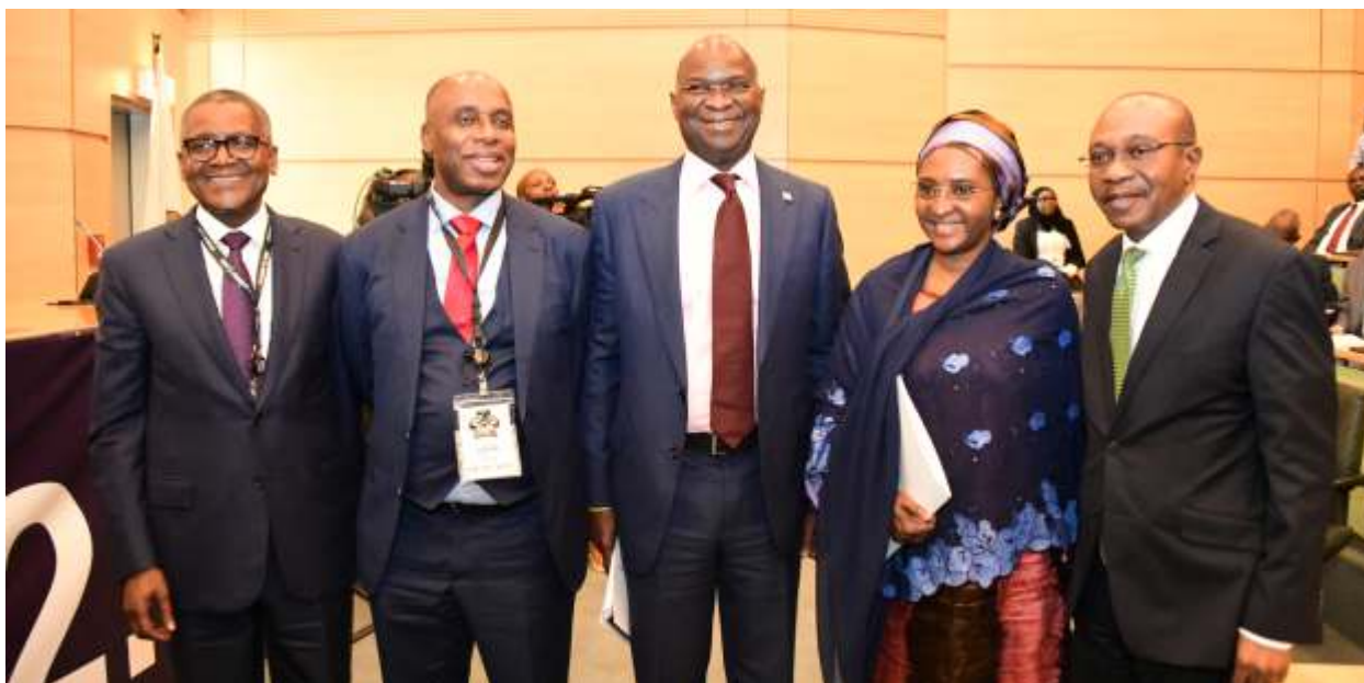
From the left to right: Aliko Dangote (Founder/Chairman of Dangote Group), Rotimi Amaechi (Minister of Transportation), Babatunde Fashola (Minister for Works and Housing), Zainab Ahmed (Minister of Finance) & Godwin Emefiele (Governor, Central Bank of Nigeria)

in the near future because of the import-dependence status of the Nigerian economy. Analysts were sure that the CBN would defend the Naira at all cost. Then there is power sector issue, which remains key to the country's development as a mega economy.