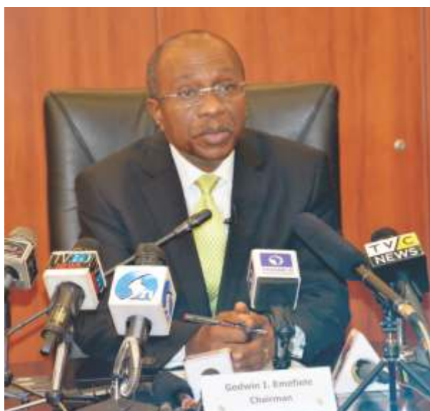
The Governor addressing the Association of African Central Banks (AACB)

As a way out of the situation, he emphasized the need for the country to invest in basic infrastructure such as roads, bridges, airports, railways and information technology, adding that the country also needed to explore opportunities for Public Private Partnerships in infrastructure projects that could offer lucrative returns to investors and help drive economic growth across Nigeria.