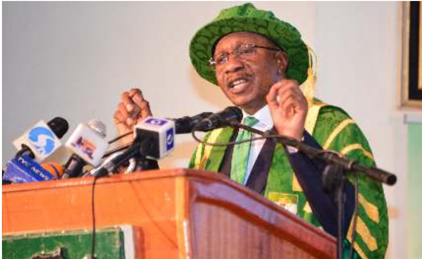
Delivering a public lecture