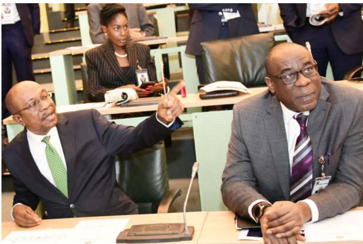
Governor Emezie pointing the way forward

rice production. So also, is the bumper harvest that have been recorded in sorghum, maize, millet, cassava, tomatoes and cotton farmers under the CBN's Anchor Borrowers' Programme. With improved financing by the banks, to enhance capacity utilization of agricultural firms involved in the production of the 10-identified commodity models; the country has begun to witness high production as well as increased income for farmers. However, critics of Emezie had questioned his intervention policies, accusing the CBN Governor of straying from the bank's mandate of monetary policy formulation into foggy terrain of fiscal matters.