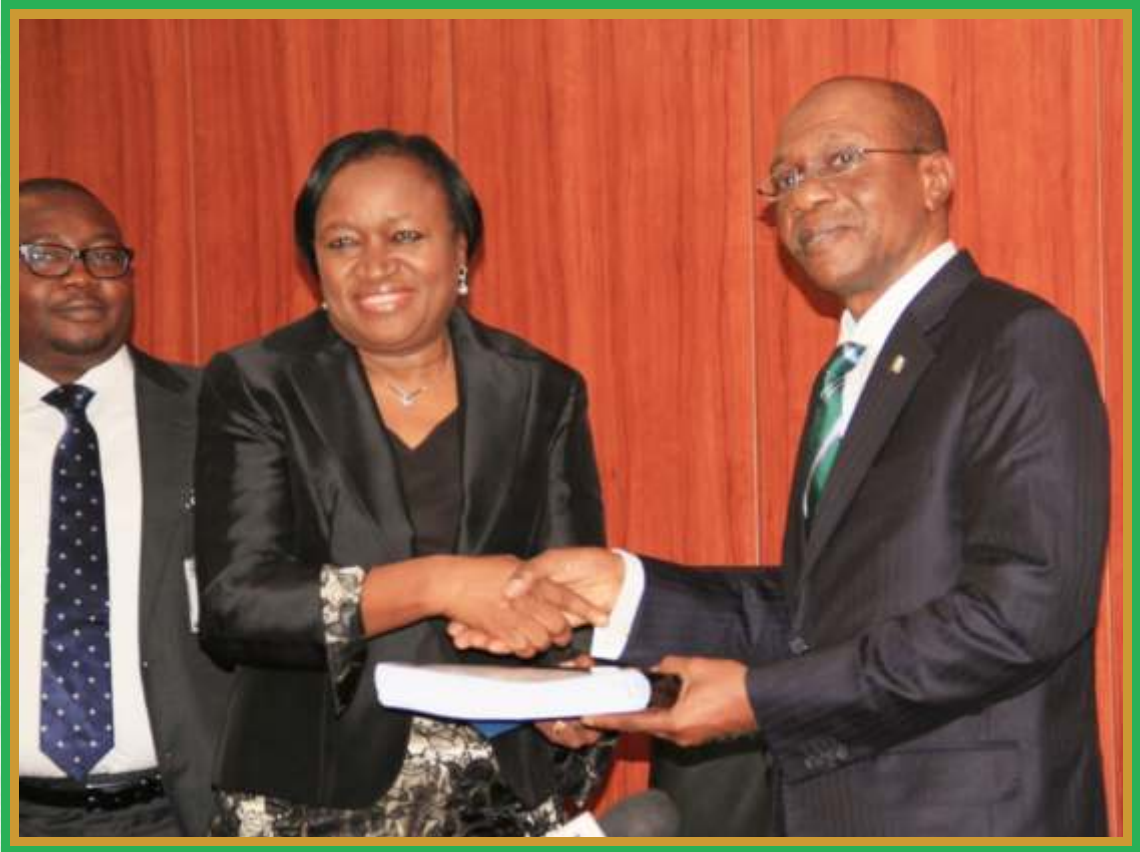
Dawn of the Emefiele Era