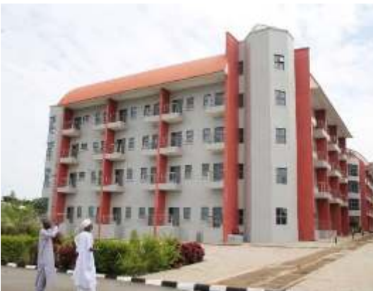
Centre of Excellence, Ahmadu Bello University, Zaria