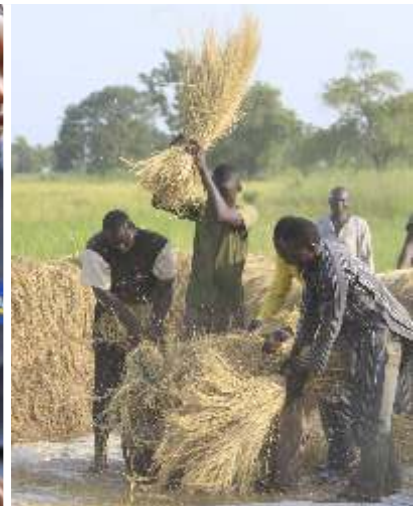
Home grown Rice threshing in Niger