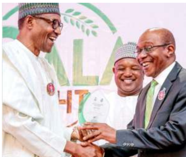
Sharing a joke with President Muhammadu Buhari

T he Governor, Central Bank of Nigeria, Mr. Godwin Emefiele's appointment was renewed by the President and confirmed by the National Assembly on Thursday, May 16, 2020, having performed credibly in his first tenure which resulted in the exit of the nation from economic recession among other feats.