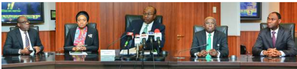
Committee of Governors

The former colonial economies concentrated on the production of extractive minerals and unprocessed commodities for exports with negative terms of trade vis-à-vis manufactured exports from developed countries; a situation which Latin American economists like Raul Prebisch and Han Singer consider as likely to perpetuate poverty in the emerging economies.