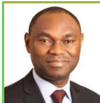
Kingsley Obiora Deputy Governor (Economic Policy)