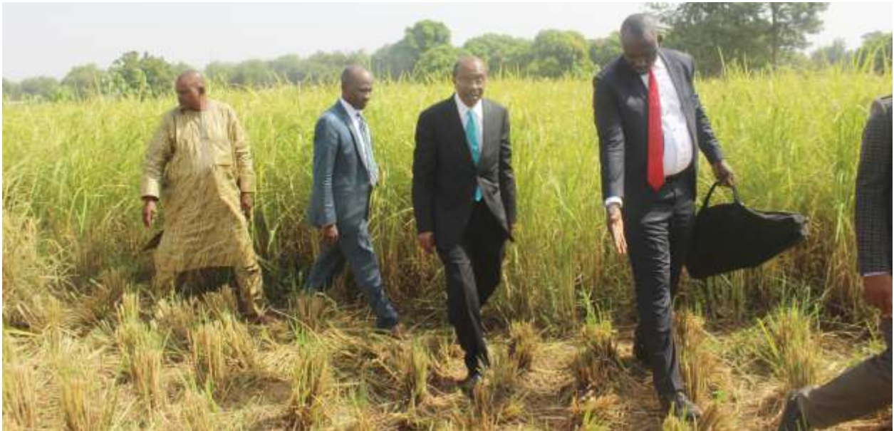
Touring a Farmland in Birnin Kebbi