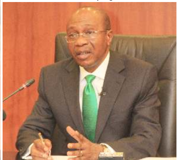
Addressing the press