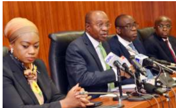
MPC press briefing

He further revealed that the Bank would expand its developmental initiatives to include youth entrepreneurs in the creative industry and give focused support to the educational sector. Among the steps taken to build on the successes of the Governor's first tenure, was the unveiling of the Bankers' Charitable Endowment Fund; maintaining a tight Monetary Policy stance, particularly in view of rising inflation expectations; pushing for improved domestic production in agriculture and manufacturing; and support in diversifying the economy.