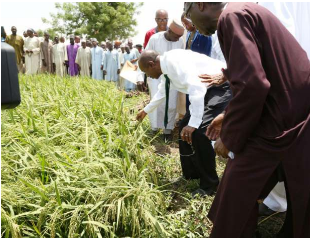
Inspection of Rice farm in Niger State

M r. Godwin Emefiele in his maiden address as the CBN Governor on June 5, 2014, declared that his vision is to ensure that the Central Bank of Nigeria was more people focused, as its policies and programs would be geared towards supporting job creation. He also pledged to improve access to credit for MSMEs, deepening intervention programme in the agricultural sector, building a robust payments system infrastructure that will help drive financial inclusion. And in addition, focus on key macroeconomic concerns such as exchange rate stability, financial system stability and maintaining a strong external reserve.