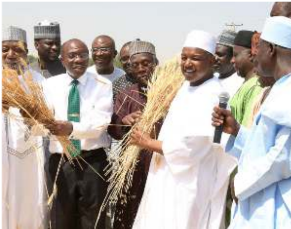
With Kebbi State Governor at the launch of ABP

Following the emerging game changing success in the rice and cotton sector, the Central Bank of Nigeria under the leadership of Mr. Emefiele financed 15,569 cassava farmers with the sum of N2 717,709,071 to cultivate over 15,000 hectares of land across 19 States under the Nigeria Cassava Growers Association. As a result, eight processors were financed with the sum of N11 billion to produce various identified derivatives such as