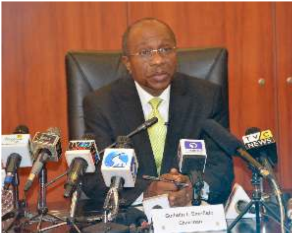
Question time with the press