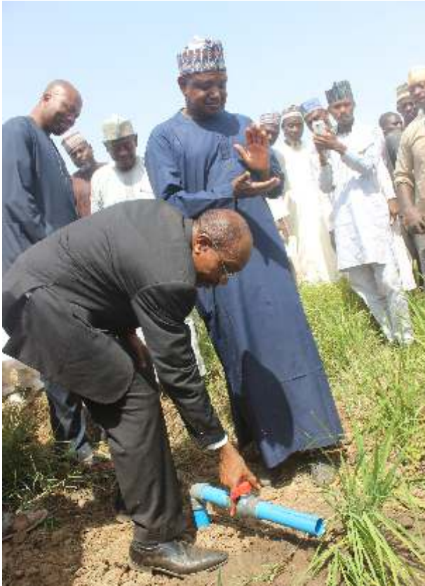
Flagging off dry season farming