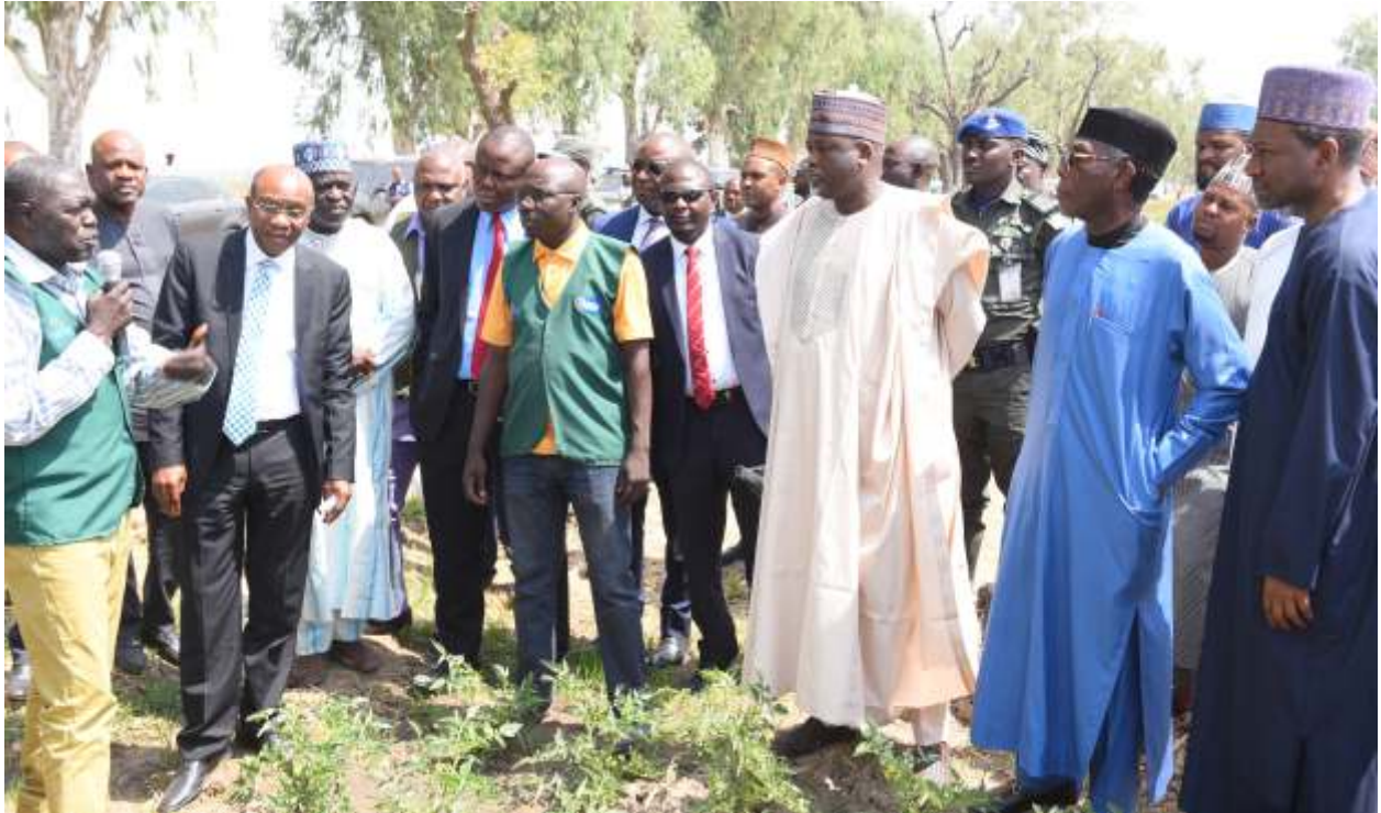
Inspection of Dangote Tomato company in Kano