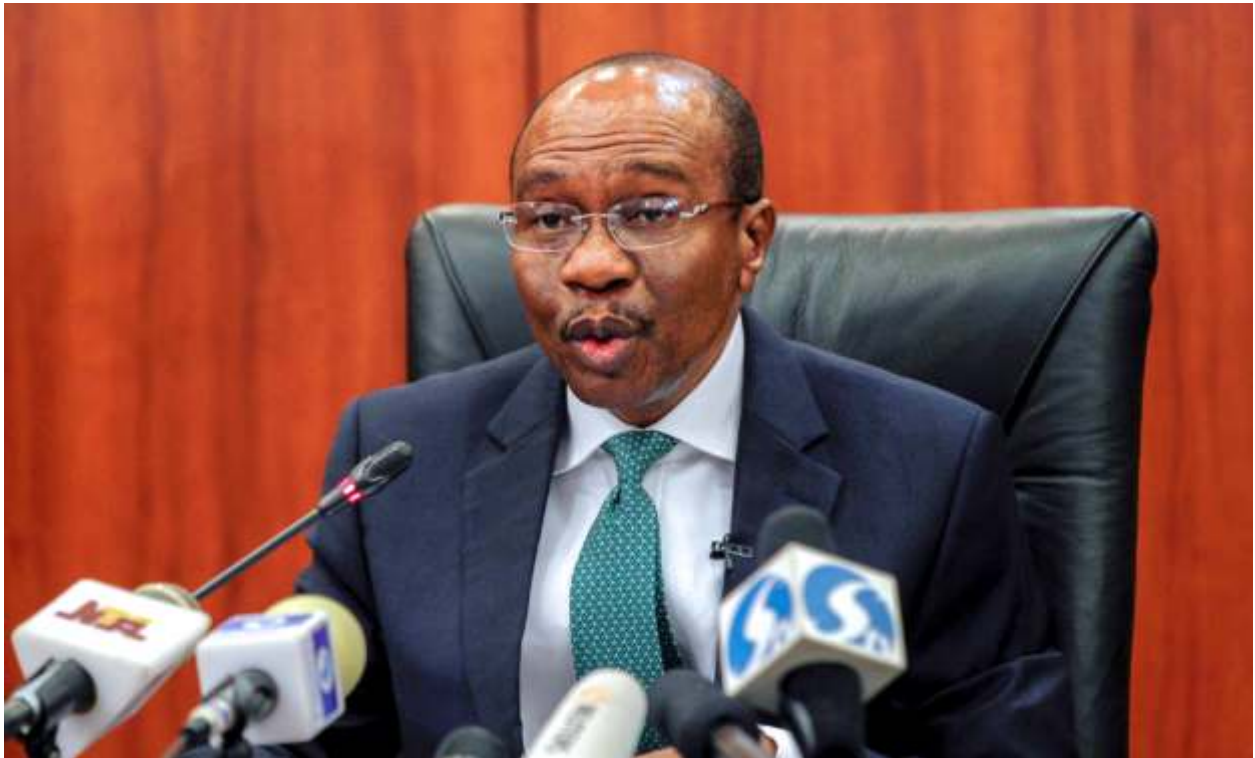
Emefiele at an MPC press briefing

A s the central bank and monetary authority of the country, the major regulatory objectives of the Central Bank of Nigeria (CBN), as stipulated in the Bank's enabling Act, are to maintain the external reserves of the country, promote monetary stability, a sound financial environment and to act as a banker of last resort.