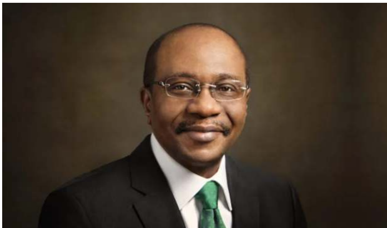
Godwin Emefiele, CON, Governor, Central Bank of Nigeria

Governor. Emefiele completed the process of the appointment when he swore to relevant oaths on June 3, 2014 to become the 11th (eleventh indigenous) Governor of the Central Bank of Nigeria (CBN). When Godwin Emefiele assumed office, Nigeria faced a series of challenges and spillover effects from the global economy. However, with dexterity and a team of committed staff at the Bank, the CBN has been able to steady the economy with people-centered policies.