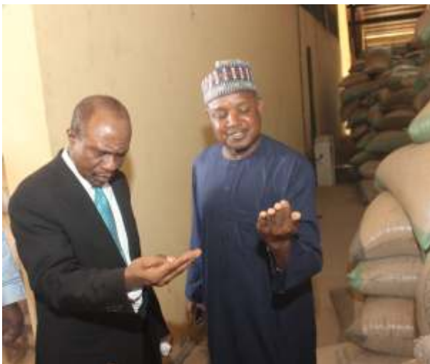
Inspecting rice paddy

The sum of N200billion was set aside for the refinancing/restructuring of SME/ Manufacturing portfolios while the sum of N300billion was applied to power and airline projects.