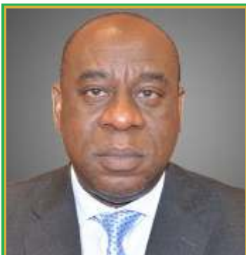
Folashodun A. Shonubi Deputy Governor (Operations)