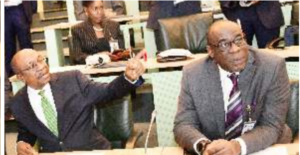
That's the way to go