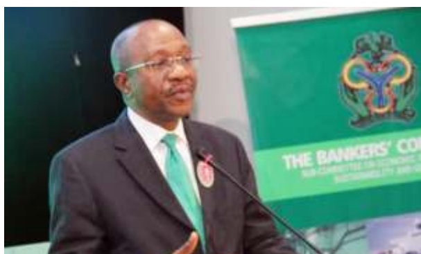
The Governor delivering an address at a Bankers' Committee Meeting

in banking, declared that his desire was to lead a central bank that spends its energies on building a resilient financial system that can serve the growth and development needs of Nigeria.