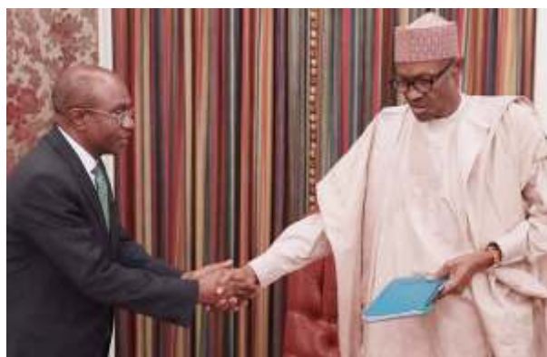
Briefing the President

companies. They were granted sole rights to import milk and dairy products into the country and they in turn would build milk processing factories in the country. The six companies which keyed into Nigeria's backward integration agenda are: FrieslandCampina WAMCO Nigeria, Chi Limited, TG Arla Dairy Products Limited, Promasidor Nigeria Limited, Nestle Nigeria Plc, and Integrated Dairies Limited,