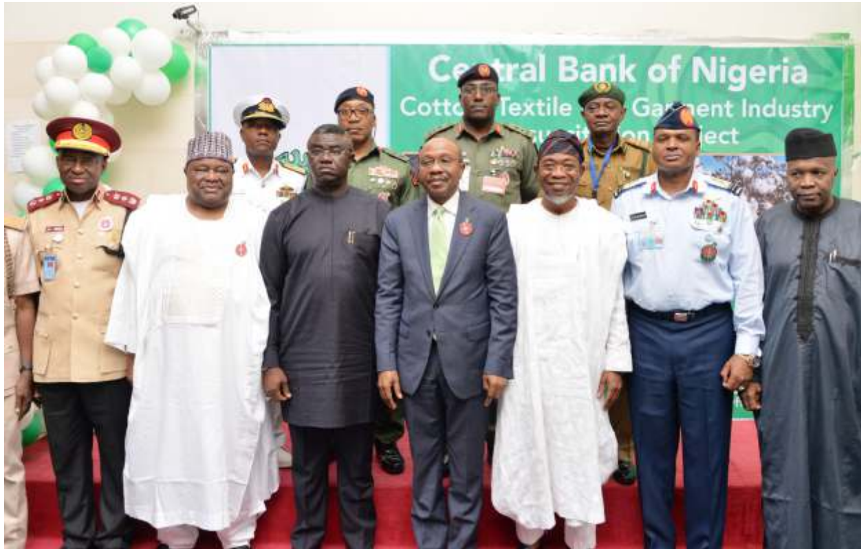
MOU signing ceremony of the Armed Forces, Paramilitary and Local Textile Producers

Watching the Central Bank of Nigeria (CBN) Governor, Mr. Godwin Emefiele, responding to questions at the May 28, 2020, Monetary Policy Committee (MPC) meeting, one cannot but see through the burden of a man with the patriotic zeal for a self-reliant economic development.