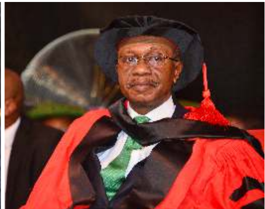
Receiving the Honorary doctorate degree at UN