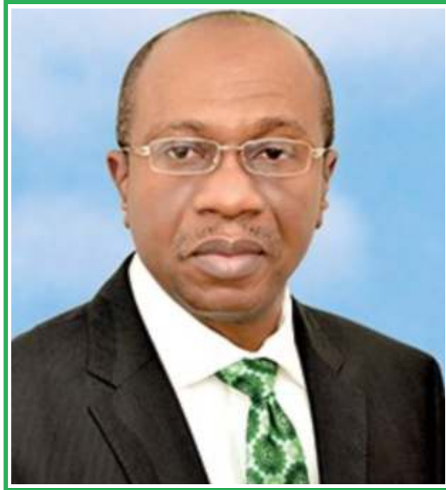
Official portrait of the Governor of the Central Bank of Nigeria, Mr. Godwin Emefiele

M r. Godwin Ifeanyi Emefiele, CON, is the current Governor of the Central Bank of Nigeria, having assumed office on June 3, 2014.