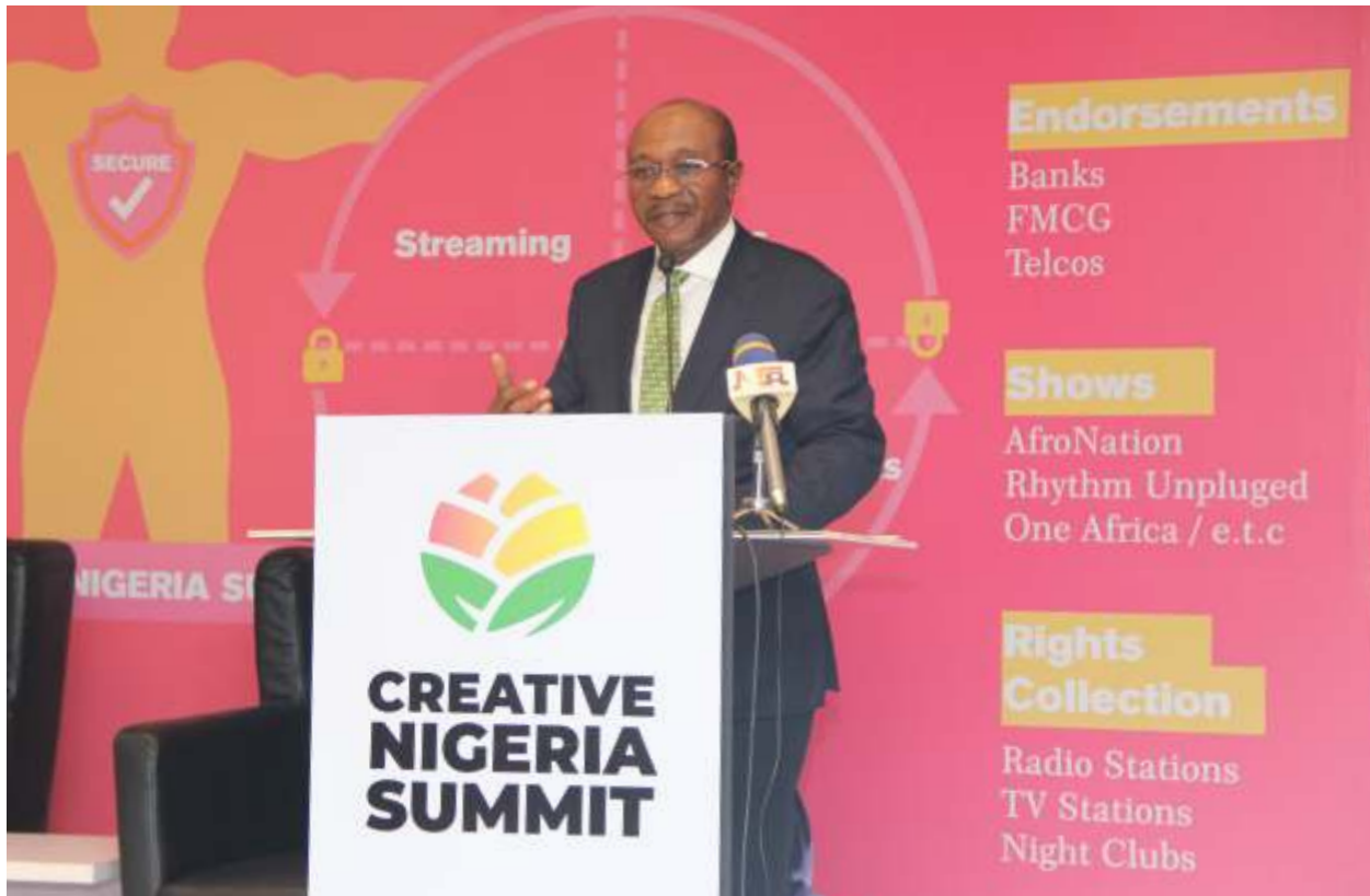
Governor Emefiele as a guest speaker at the Creative Nigeria Summit, Lagos