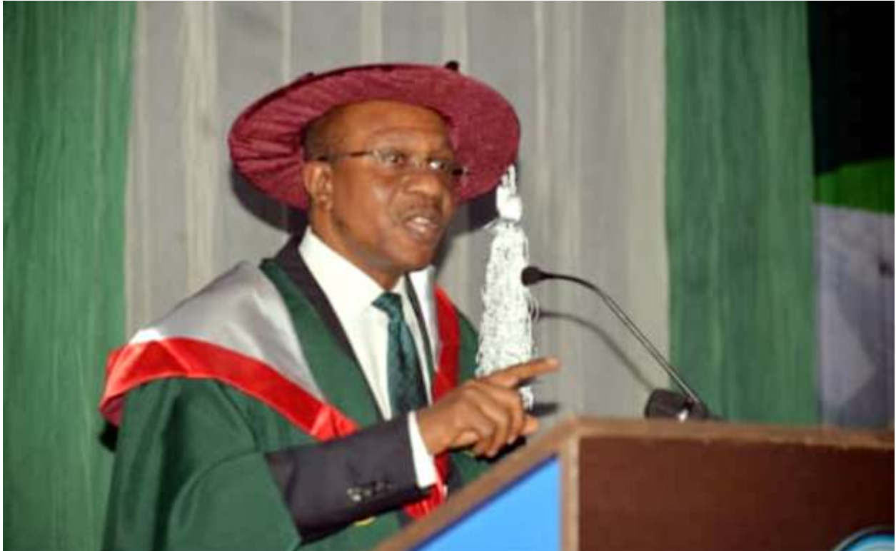
The CBN Governor, Godwin Emefiele, delivering a public lecture

G overnor Godwin Emefiele used every opportunity to explain and canvass support for the heterodox monetary policy stance of the Bank. He took this advocacy to several Nigerian universities and institutions in a series of public lectures. On Saturday, July, 22 2017, Mr. Godwin Emefiele challenged tertiary institutions in the country to focus on research that will boost economic development. He assured that the CBN would work with relevant stakeholders in the educational sector to stimulate research for the overall good of Nigeria. He gave the charge while delivering a lecture entitled: "The Dilemma of Monetary Policy and Exchange Rate Management in a Recession: Potential Options for Nigeria" at the second Homecoming Series of the Economics Department of the University of Nigeria, Nsukka (UNN).