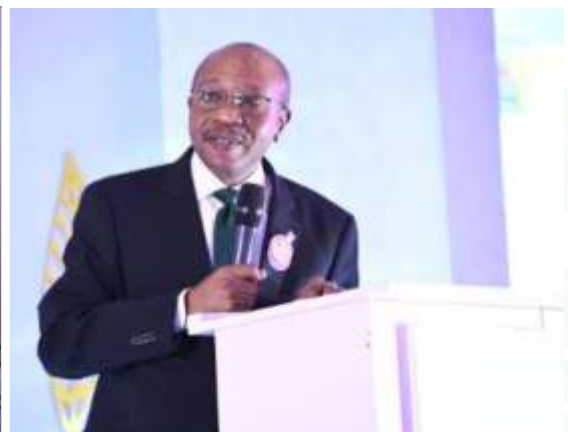
Appreciating members of staff