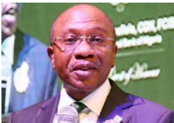
Emefiele speaking as special guest of honour at the 54th CIBN Annual Dinner

of Bankers of Nigeria (CIBN) on Friday, November 30, 2019. At this forum, Mr. Godwin Emefiele outlined the monetary policy thrust for 2020, saying that the Bank is of the view that the short-term outlook of the Nigerian economy remained good, adding that the tight stance of the Bank was expected to continue in the near-term, due to the rising inflation expectations and exchange market pressures.