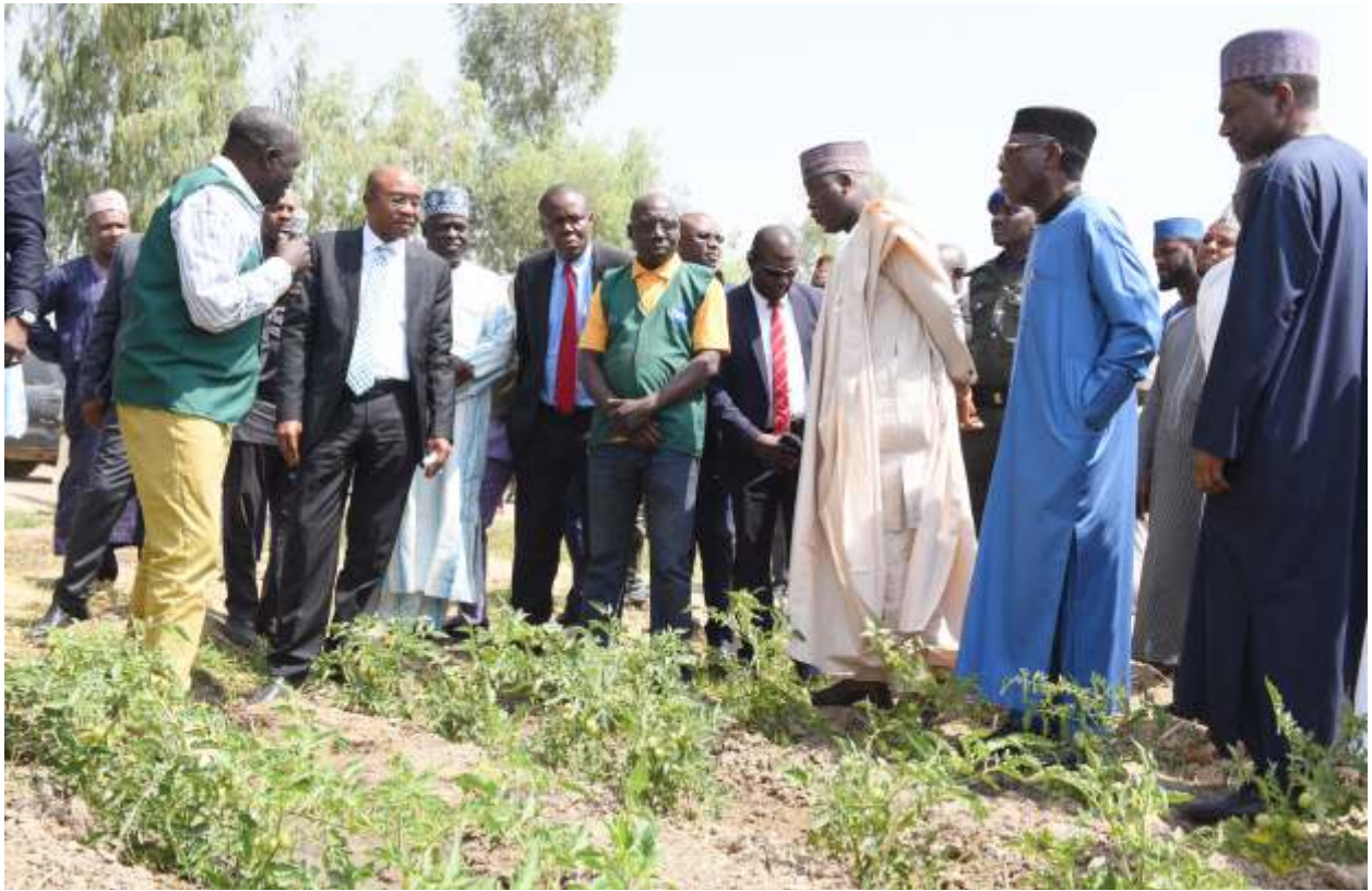
On a tomato farm

M r Emefiele in supporting the efforts to create jobs and diversify the economy away from crude oil has established numerous intervention programmes, such as Anchor Borrowers' programmes (ABP), Commercial Agricultural Credit Scheme (CACs), Creative Industry Financing Initiative (CIFI) MSMEDF, CBN AGMEIS, Real Sector Support Financing (RSSF) and so many others.