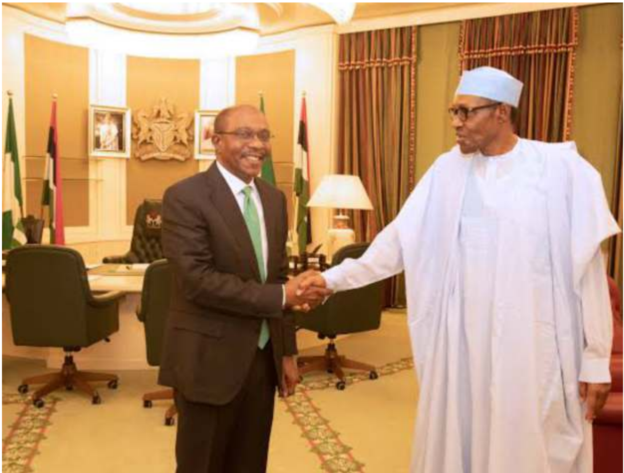
In a warm handshake with President Muhammadu Buhari

In view of the fact that the primary objective of banking supervision is to promote the safety and soundness of banks and the banking system, it was evident that the capacity and quality of supervision, needed to reflect the loan concentration of the banking industry.