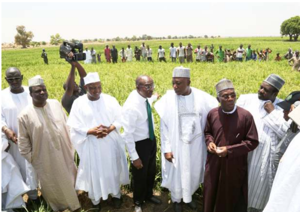
With stakeholders on a farm

This was in line with his vision to create jobs and unleash the creative talents of youths. This development aims to enhance skill acquisition for over two hundred thousand Nigerians and reduce the country's dependence on crude oil.