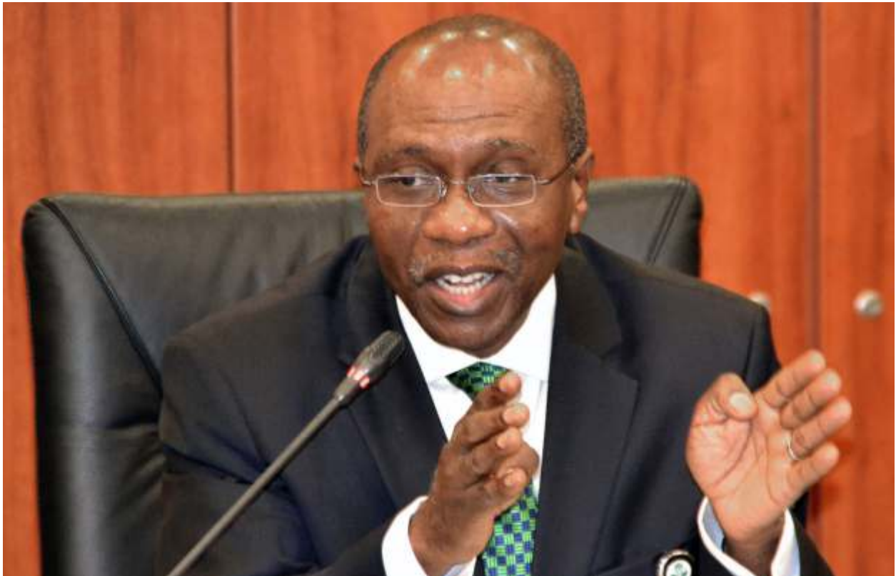
The CBN Governor at his maiden World Press Conference on June 5, 2014

M r. Godwin Emefiele walked into the annals of the Central Bank of Nigeria (CBN), when he assumed office on June 3, 2014 as the tenth indigenous Governor of the financial regulatory institution.