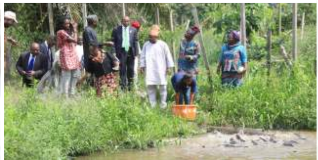
Inspecting the Ogun Fish project under the anchor borrowers programme