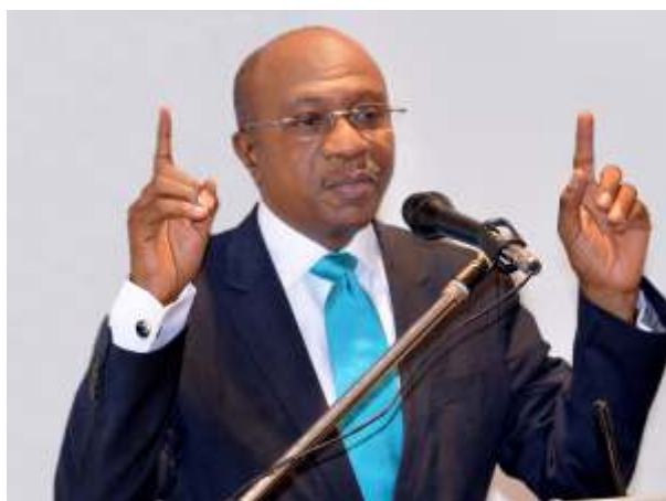
Celebrating the second term

as well as the entertainment industry. Mindful of a mono-product economy that is highly vulnerable to external shocks, with crude oil production and export constituting more than 90 per cent of foreign exchange earnings, the CBN Governor, persistently focused his radar in ensuring stability in the forex market and to preserve foreign reserves.