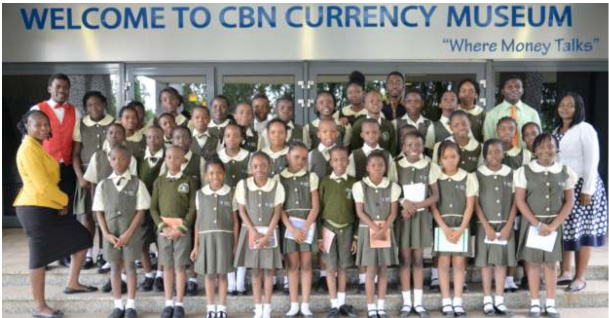
Students on an excursion to the Currency Museum, CBN Head Office