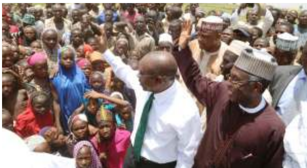
Exchanging pleasantries with the farming community in Niger State