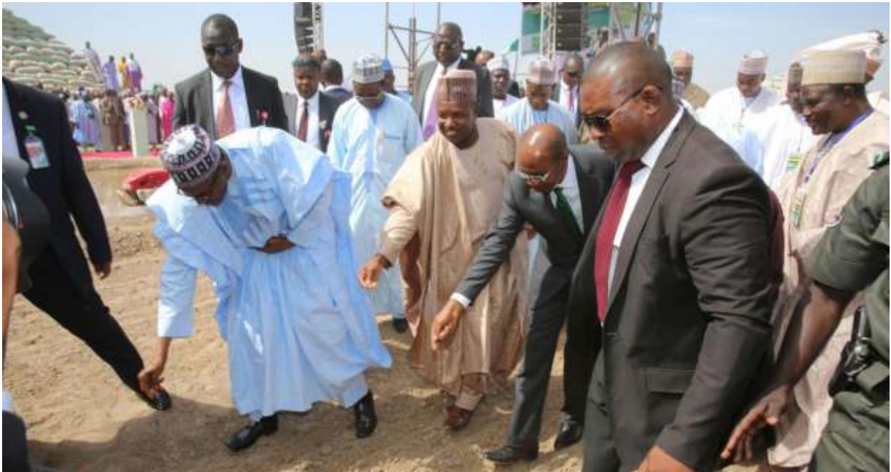
Official launch of ABP in Birnin Kebbi

Prior to the introduction of Anchor Borrowers' Programme, the Central Bank of Nigeria had announced 41 items not eligible to access forex from the Nigerian Forex Market. Allocation of foreign exchange to the importation of items such