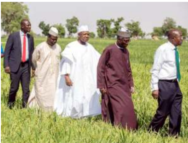
On a farm inspection

ethanol, starch and sorbitol. To restore the Oil Palm sector to its past glory as a major contributor to forex earnings, the Central Bank of Nigeria gave oil palm producers a lifeline. This was to ensure improved massive production of palm oil to meet local market demand and increase export to conserve foreign exchange. Nigeria was the world's leading producer and exporter of oil palm in the 1950's and 1960's with about 40 percent share of global market. But today, the country barely produces up to 3 percent of the global supply and this has led to a huge loss of $10 billion annual foreign exchange earnings.