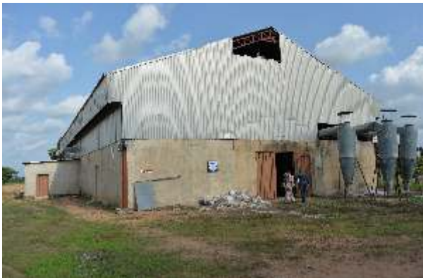
Cotton Ginny in Zamfara State