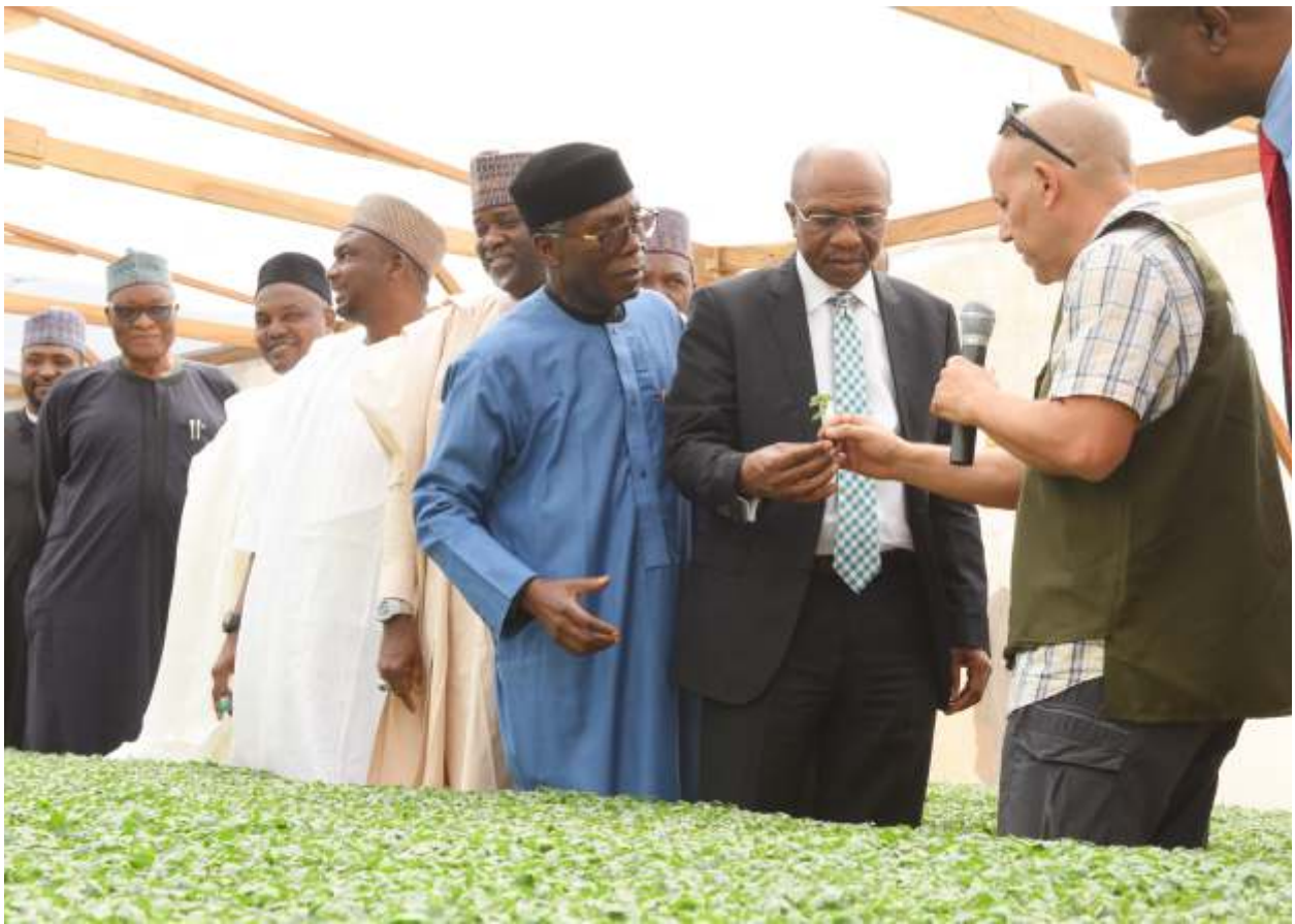
Inspection of Tomato farm in Kano