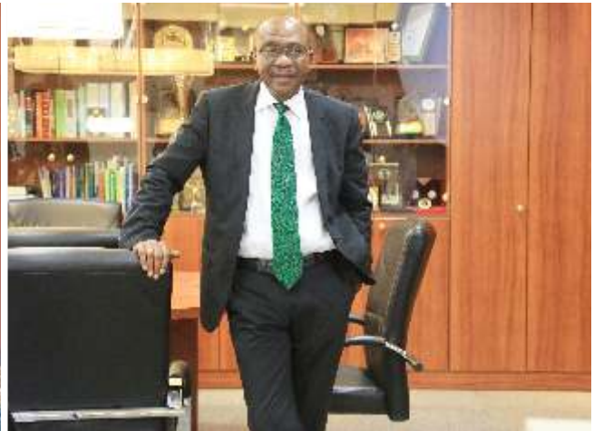
A relaxed Governor Emeifele