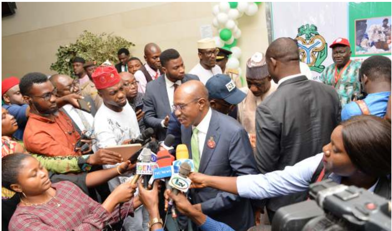
Addressing the press

After much sensitization across the country, the cashless policy was re-introduced in September 2019 in 6 States across geo-political zones and the FCT. The cashless policy was implemented nationwide by 1st April, 2020.