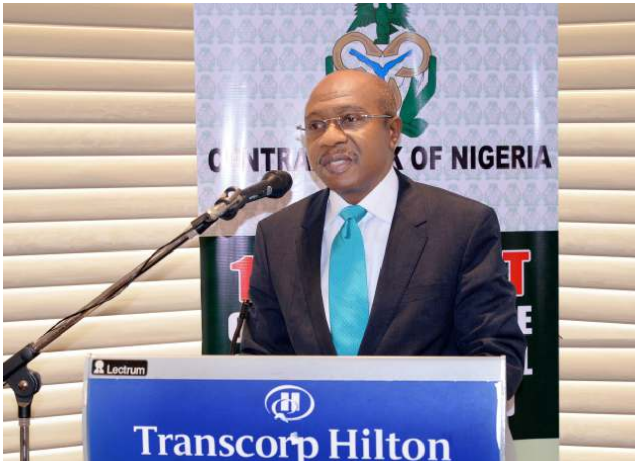
Declaring an event open

The past six years of central banking in Nigeria have witnessed some dramatic turn of events and challenges. Interestingly, the technique deployed in resolving these challenges has been ingenious, or rather far from usual expectations. This could, to a reasonable extent, surmise the leadership style and strategy of the Governor of the Central Bank of Nigeria (CBN), Mr. Godwin Emefiele, since he stepped into office in June, 2014.