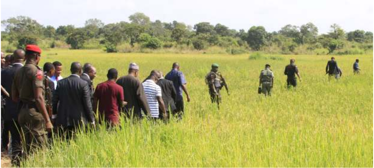
Taking a tour of Farmland in Cross River State